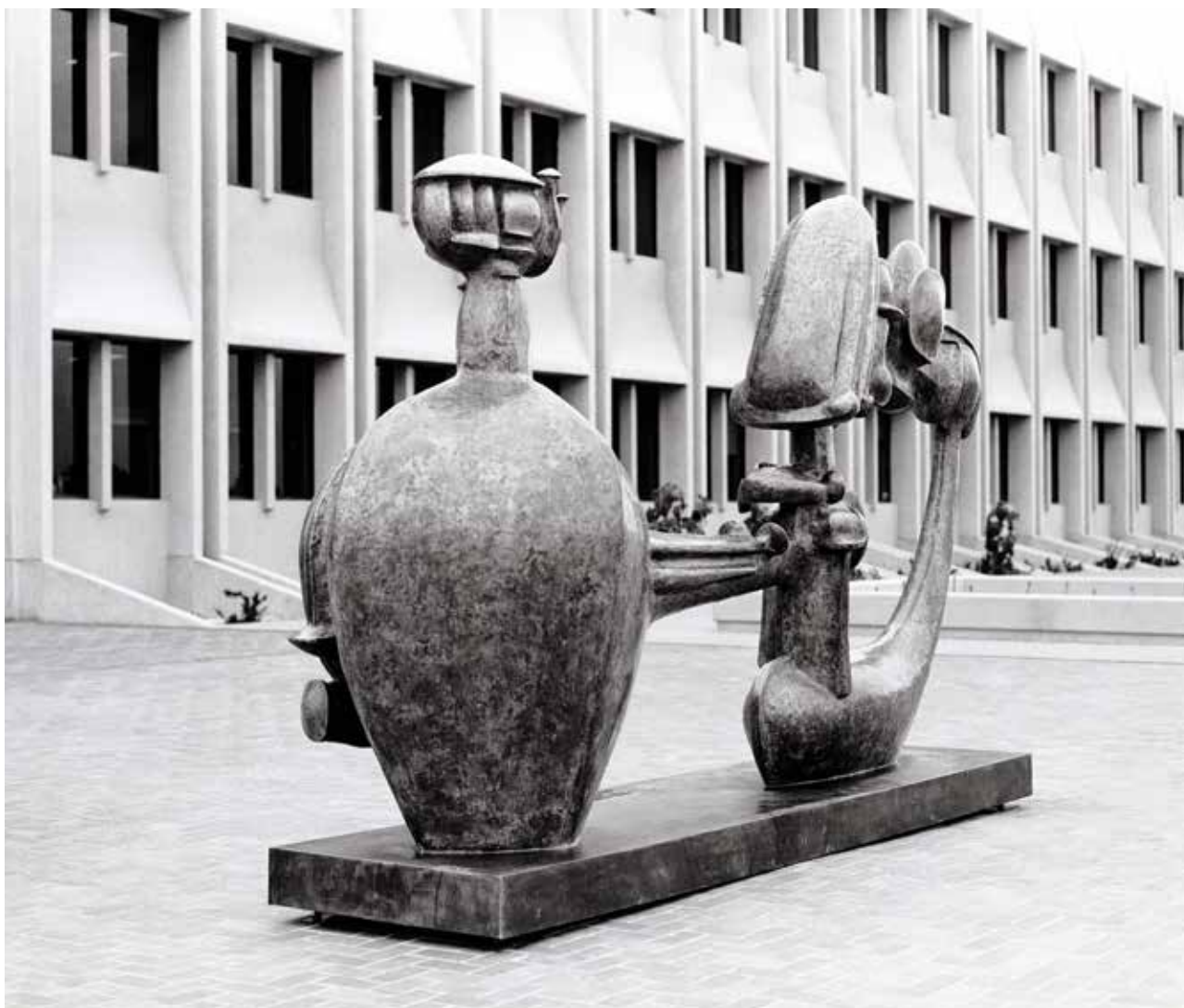
James Lee Hansen, Shaman , 1971, bronze, 8' x 14'; Washington State Capitol Campus, Olympia. The Washington State Department of Transportation Building is visible in the background.

His sculpture is also included in corporate collections throughout the Pacific Northwest.