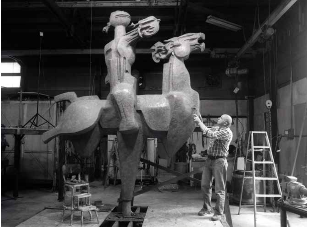
The artist with a work from his Equestrian series— Autumn Rider , 1987. The twelve-foot-tall bronze was commissioned by Gresham Town Fair in Gresham, Oregon.